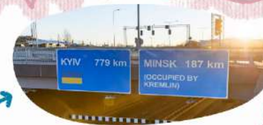
Road signs 'adaptation'

Website with all the important information in one place: ukraina.vilnius.lt