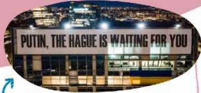
Message on the building

65 schools to have new class friends + UA private schools relocated to Vilnius